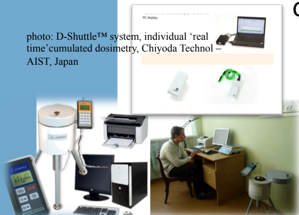
photo: Equipment of a local center for developing practical radiological protection culture Institute of radiology, Gomel, Belarus