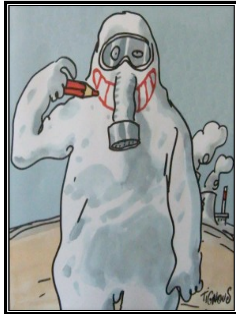
Drawn by Tignous killed in the Charlie Hebdo shooting on 7 January 2015