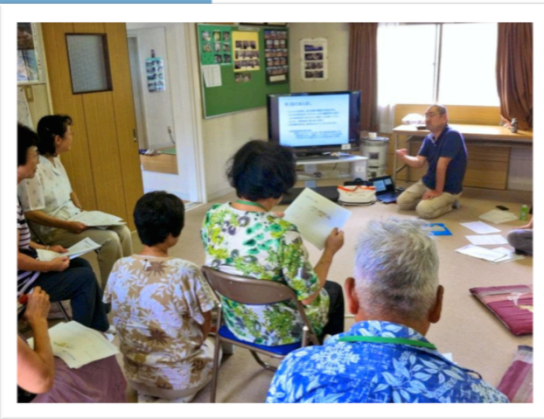
photo: Ethos in Fukushima, Medical doctor dialoguing with people relocated after the Fukushima accident, Japan (ethos-fukushima.blogspot.fr/)